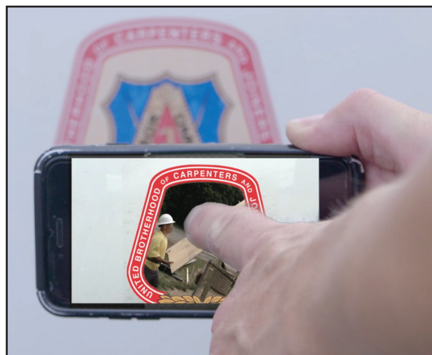
Augmented Reality (interactive Video) Scan Function