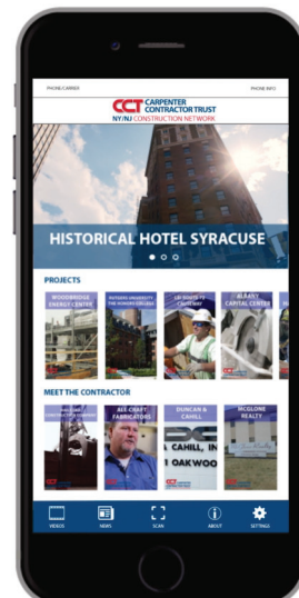
Video Landing Page